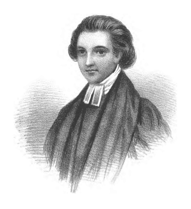
WILLIAM JAY. At:19.